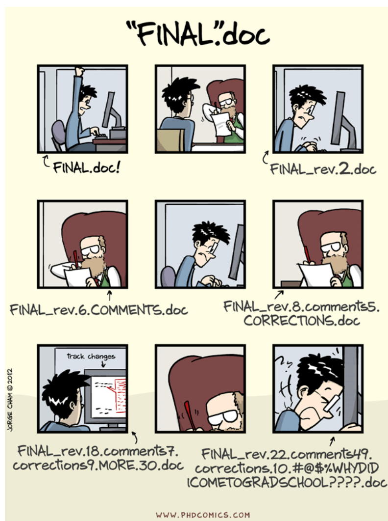
Figure 1: Typical(?) result after version control by renaming.

Collaboration: Everyone who has tried to collaborate with other people by sending files, or parts of files, over email knows how fragile that is.